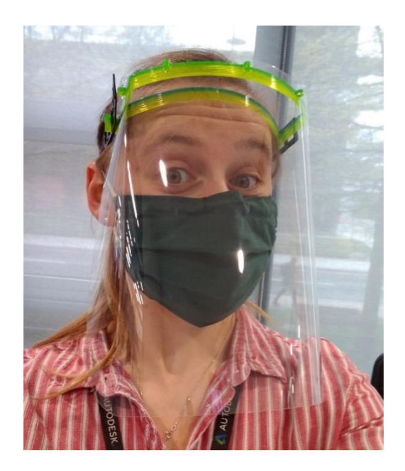
Fig.3: The woman behind the mask.

Overall, the work of the author, the woman behind the mask (Figure 3), has shown that PhD research can play a key part in the teaching curriculum. Their work on 3D printed face shields has not only aided the community in unprecedented times but has enabled the School of Engineering to deliver a safe and effective blended learning course for its students including the essential face-to-face teaching needed in Engineering degrees. The visible role of PhD research is at the heart of the author's teaching philosophy, showing what research at the forefront of technology can do in a teaching space such as the Engineering Build Space at the University of Warwick.