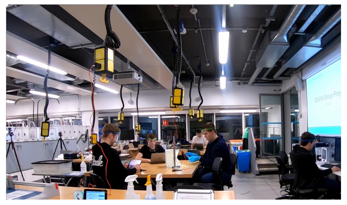
Fig.2: Undergraduate students returning to practical work, wearing protective face shields made with 3D printed components.

previously unthinkable practical sessions. The face shields also allowed for final year students to return to their practical group projects using advanced equipment only available in the Engineering Build Space ( Figure 2 ).