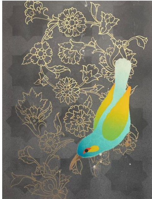
Figure 10: Acrylic and spray paint on canvas 30 × 40 inches

As Shovir notes ‘Attar’s poem is a mirror to see parts of ourselves and others. And Flying is a metaphor for walking on a spiritual path’ (Shovir-Hosseinioun 2022). Notably, for Shovir, diaspora is a transition that still carries traces of one’s cultural heritage. However, for Hassani, diaspora represents a new platform from which to delve into womanhood and let the neglected voices of the women of her country be heard.