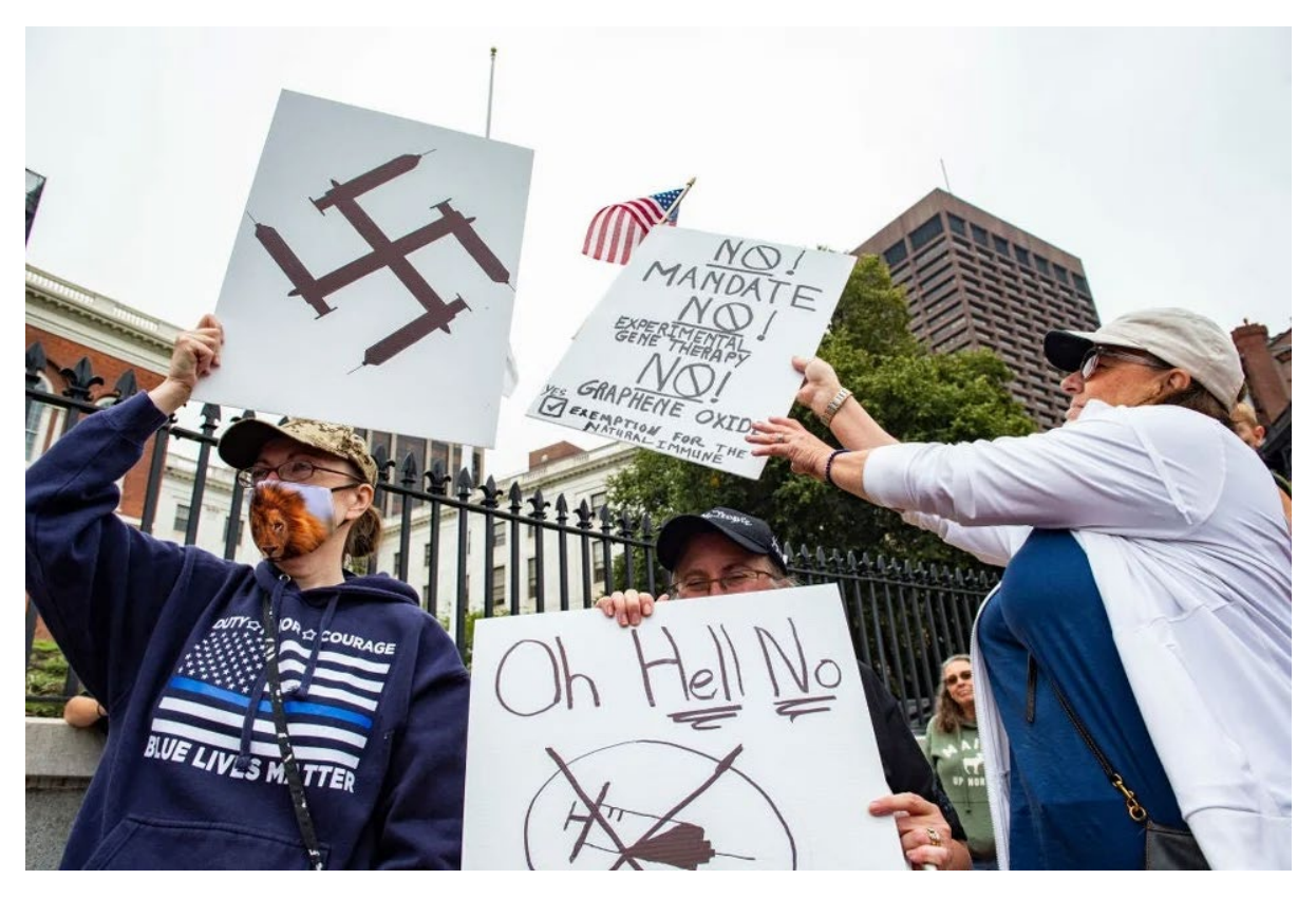
Figure 3: Anti-vaccination demonstration in Boston (US), September 2021.