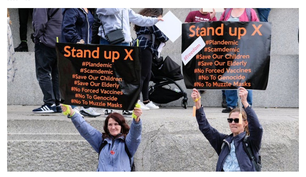
Figure 6: Anti-lockdown demonstrators in London, September 2020.

This points to a paradox that characterises contemporary conspiracy theories and makes them, at the same time, most vulnerable to critique as well as immune from it. The substantive content of these theories, offered