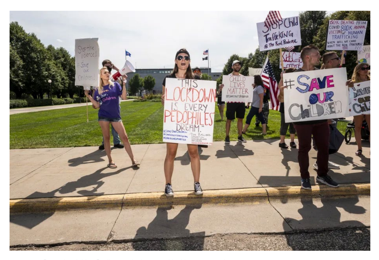
Figure 2: A "Save the Children" rally outside the Capitol building in St. Paul, Minnesota, on August 22, 2020

The issues of opposition to Covid vaccinations, which involve conspiracy theories about vaccination and public health-based restrictions, builds on these existing forms of far right conspiracy theory. Opposition to vaccination adopts this same language of victimhood that is a central feature of 'white replacement' theories, combining anti-statist sentiments alongside support for authoritarian movements and states. Nothing illustrates the fantastical and incoherent nature of the claims these groups make more than the way anti-vaxxers, while waving banners with swastikas, define themselves as the 'new Jews' living under the new 'Covid Nazi' regimes – endowing themselves with yellow star of David patches where they have written AV (anti-vaxxers) instead of the original Nazi 'Juden' (Jew).