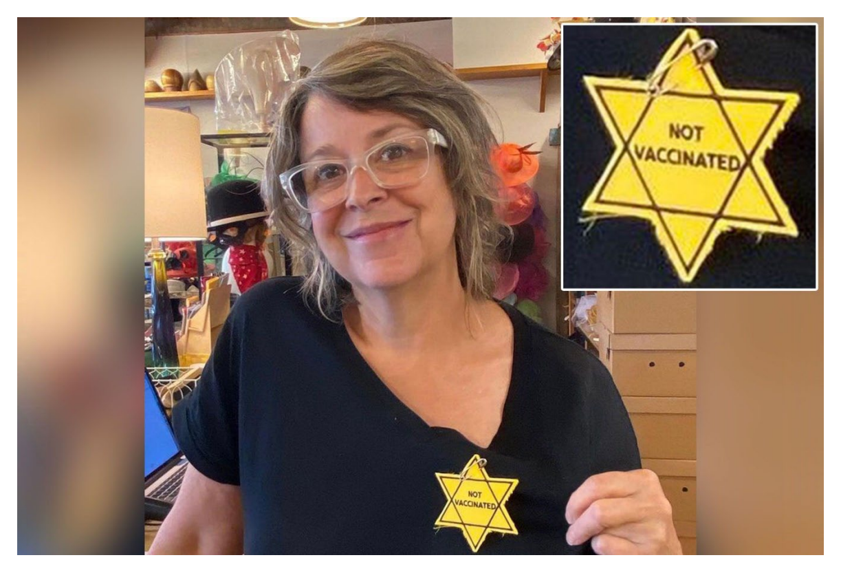
Figure 4: A hat shop in the US town of Nashville has sold 'not vaccinated' patches modelled on the yellow stars Jews were forced to wear during Nazism.

The ideological form of conspiracy theory is central to these developments. While conspiracy theories have always existed on both the 'left' and the 'right' we see the role these are playing in promoting the contemporary arguments and ideas of the far right as crucial. The dissemination of this has been massively facilitated by their promotion by the state in the case of the US under Trump. Alongside this is the huge impact and significance of the online space. The role Trump played in promoting conspiracy theory was unimaginable outside the context of his use of Twitter. It is a mistake to see the constant and relentless nature of these conspiratorial tweets as evidence of his irrationality, as many liberals have done. Rather this points to the effectiveness with which the far right has mastered the use of disinformation as a political campaigning tool, within the online space in particular (Phillips, 2021). Michael Butter has developed this point, arguing that the internet has not only made conspiracy theories more visible and available, but the internet has itself 'been a catalyst for the fragmentation of the public sphere'; this points to