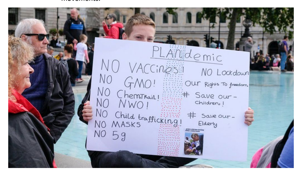
Figure 5: Anti-lockdown demonstrators in London, September 2020.

this acts as the basis of the political agency represented by these movements.