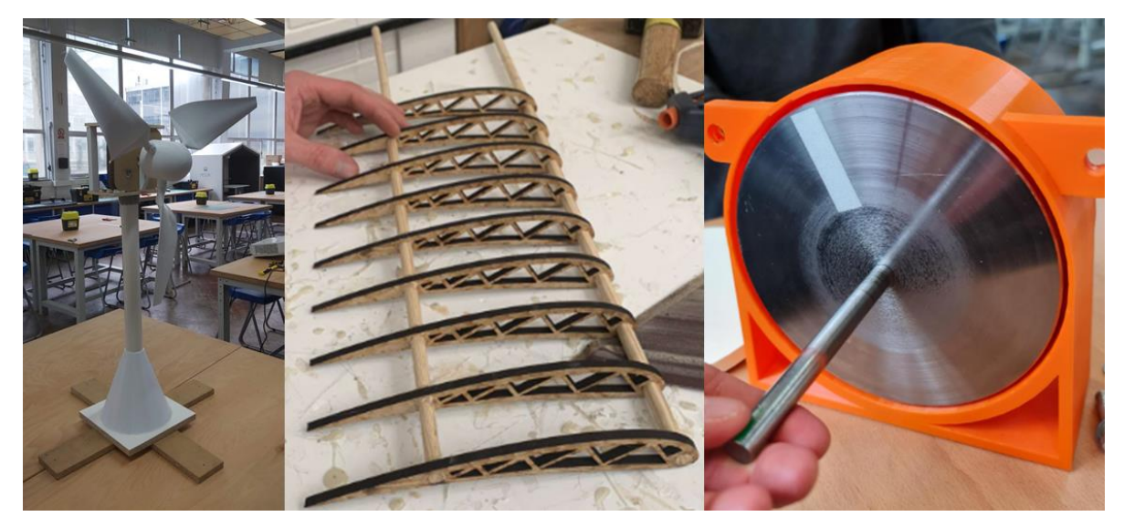
Figure 3. Example second-year activity outcomes

A significant barrier to implementing this new approach is the challenge of change. The programme documentation provides the framework, but it is also critical to provide essential resources, including both physical and staff support (Devecchi et al. , 2018). To facilitate the provision of the new programmes, great attention was placed on the learning environment. An appropriate learning environment should focus on "what the student does" not "what the teacher does" (Biggs, 1999). Considering this, all use of tiered lecture theatres was removed from the programmes with the goal being to move away from "sage on the stage" type delivery (King, 1993).