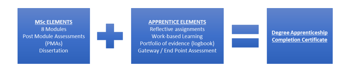
Figure 1: The Degree Apprenticeship Model (based on WMG DA)

Degree apprenticeships are considered a developing field of enquiry for higher education with a growing body of literature and the key role of universities is already fully recognised within this (Anderson et al., 2012). Initial research into the effectiveness of degree apprenticeships is largely positive. Examples include Healthcare, with Moise et al. (2021) research study covering over 200 Apprentices across 35 different clinical and non-clinical apprenticeships and showing a higher overall student retention. These figures are meeting the public sector target of the percentage of the workforce on an apprenticeship at 2.3%.