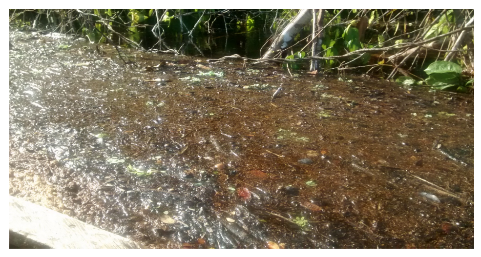
Photo 2: A close-up photograph taken in May 2015, of one of three oil sites on the River Cuninico, approximately 30-minutes up-river from the village.

River Cuninico, adjacent to the village, disputes this claim (see Photo 2). Despite the impact on the village's food and water, the company provided Cuninico with only limited provisions for five months (August-December 2015), which left community members eating contaminated fish " out of necessity " (IRC7) and drinking boiled rain or river water. Access to clean water remains an ongoing issue (Fraser, 2016).