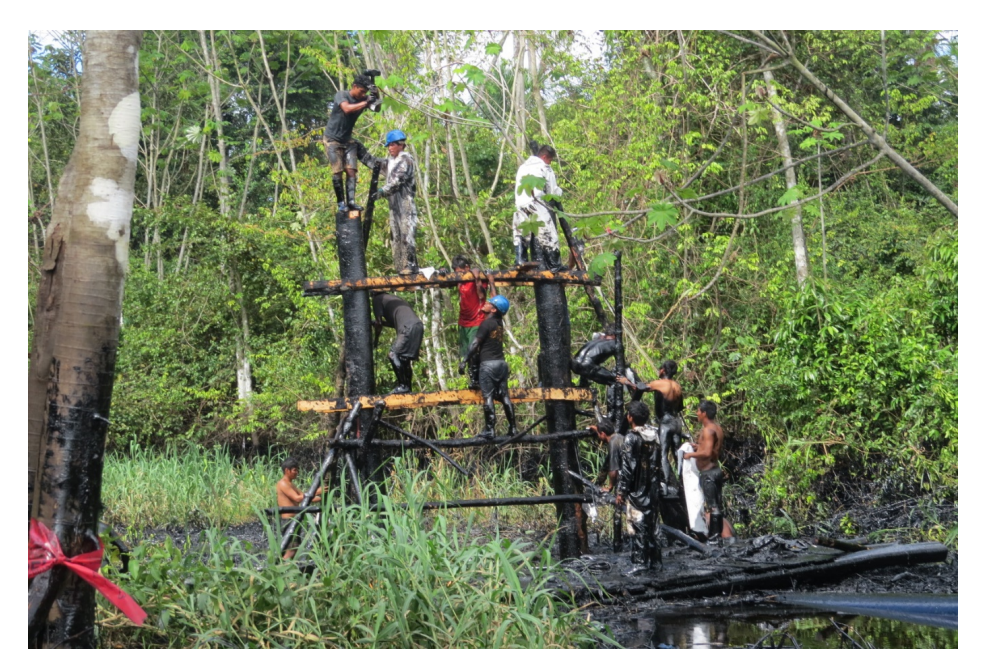
Photo 3: Cuninico residents inserting removing one of the wooden timber frames the supports the North Peruvian pipeline. The absence of heavy lifting equipment and limited white protective overalls are clearly visible.

Unsurprisingly, resident workers reported significant health problems including allergic reactions and boils, numbness and weakness in their bodies, stomach problems, sore and locked joints, fevers, pain and blood from urinating and breathing difficulties (Gonzalez, 2018a).