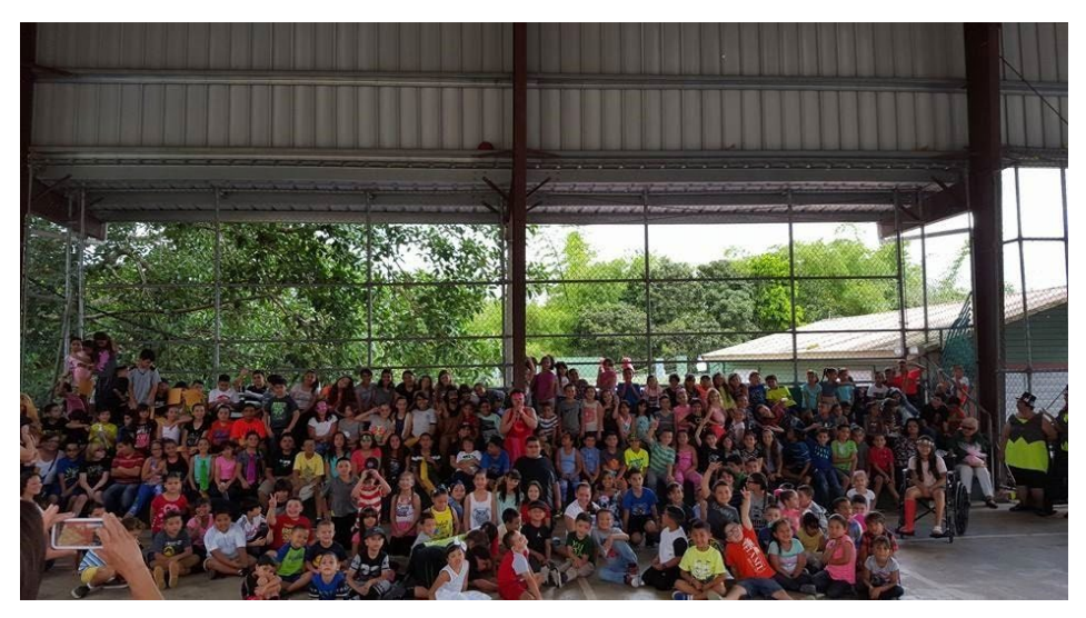
Ramón Frade students pose for a group photo in 2016. Used with permission.

In spite of her being hailed as a <u>top-notch</u> technocrat who made <u>data-driven</u> decisions, Keleher provided notoriously little data to stakeholders like parents, teachers, and concerned citizens. The "school reform law" she designed in collaboration with federal Education secretary Betsy DeVos's office also contains little in the way of data used to justify decisions. On the few occasions <u>when she offered</u> <u>criteria</u> for closures, she emphasized three: 1) deteriorated physical facilities; 2) low academic achievement; and 3) low enrollment numbers.