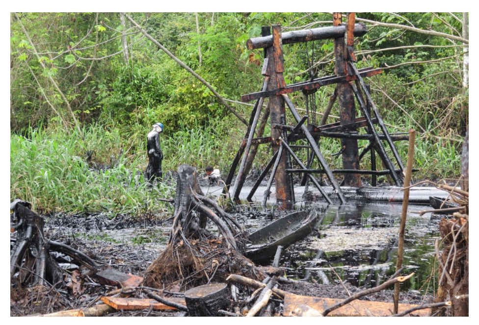
Photo 1: An indication of the pipeline's chronic state of disrepair and the impact that the Cuninico oil spill has had on the surrounding environment (Photo given to me by a Cuninico resident who himself received it from a Petroperu worker and used with their permission, June 2014).

This paper focuses on Cuninico, one of two case study communities explored in my PhD, and their relationship with the state-run company Petroperu. Cuninico is home to roughly 500 indigenous Cocama (also spelt Kokáma) located on the banks of the River Marañón in Urarinas district, Loreto province, situated roughly 11 hours away by speed boat from Iquitos. In June 2014, the village were affected by a roughly 2,000-barrel spill from the North Peruvian pipeline, which burst into its dredged floatation channel before polluting the Cuninico, Marañón and wider river systems.