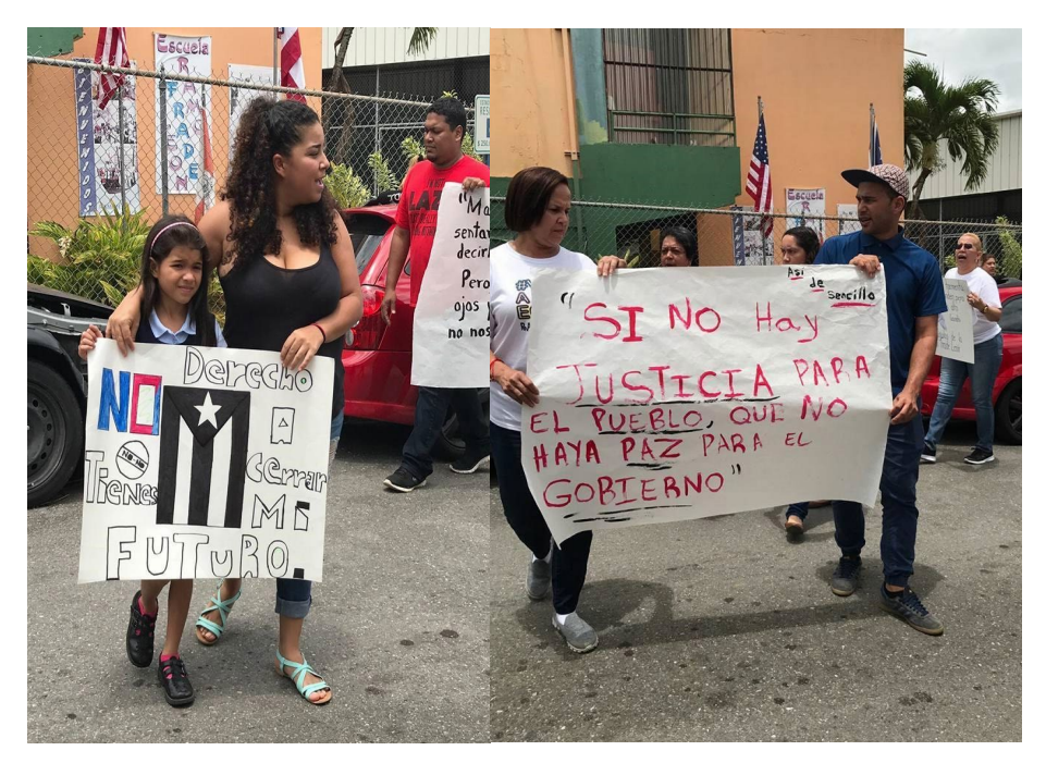
Students, parents, teachers and neighbors protesting Ramón Frade's closure. The signs read: You have no right to close down my future(L) and "If there's no justice for the people, there will be no peace for the government: it's that simple." (R) Used with permission.

Ramon Frade students were transferred to a school with scores of 15% and 38%–lower than Puerto Rico's average. More worrisome for Carmen and other teachers, Frade's special education population is already struggling with ensuring the accommodations they need in their new schools–an <u>ongoing problem</u> with many school "consolidations' on the island, a territory where <u>40%</u> of the student body needs special education services, a <u>big contrast</u> to the 14% average<sup>25</sup> in the U.S.