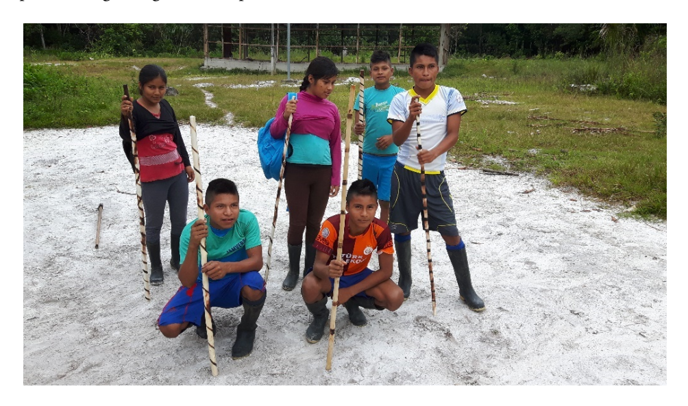
A group of Wampis youth ready for a three-day vision-seeking trek in the Kampankis hills, July 2016

Indigenous Peoples (UNDRIP) and Convention 169 of the International Labour Organization (ILO), the GTANW has received considerable international attention. Despite this, the Peruvian government has so far not taken an official position regarding the Wampis' exercise of self-determination.