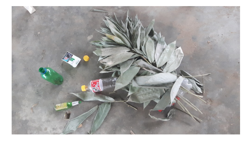
Working instruments left by the shaman after the expulsion of a pasuk spirit, February 2017