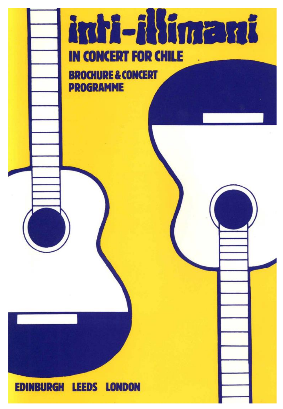
Cover of Inti-Illimani concert catalogue, 1985, from the Popular Music Archive at the University of Liverpool