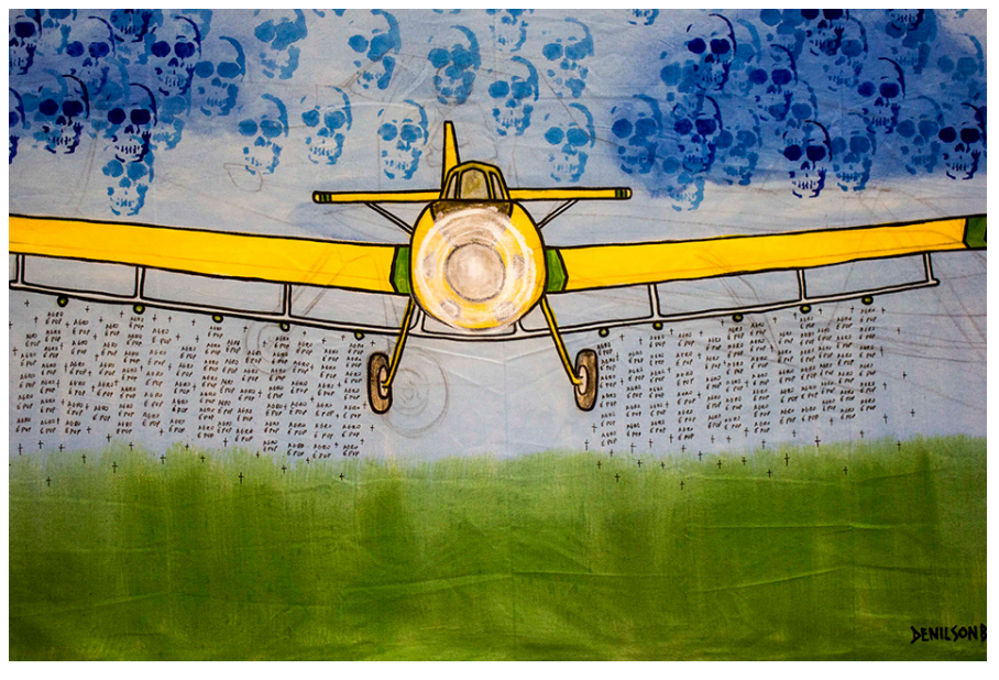
Figure 3.2 A Terra Envenenada e com Odor de Morte [The Poisoned Earth with the Smell of Death] from the series Terra Brasilis: o Agro não é pop! [Terra Brasilis: Agro is not pop] (2018) by Denilson Baniwa.

As reflected in Ficcões Coloniais , a central intention of Baniwa's reanthropophagy is to appropriate the western visual language into Indigenous terms to "rewrite Brazil through art" (Sneed, 2021), contributing to the creation of a more diverse portrayal of national history.