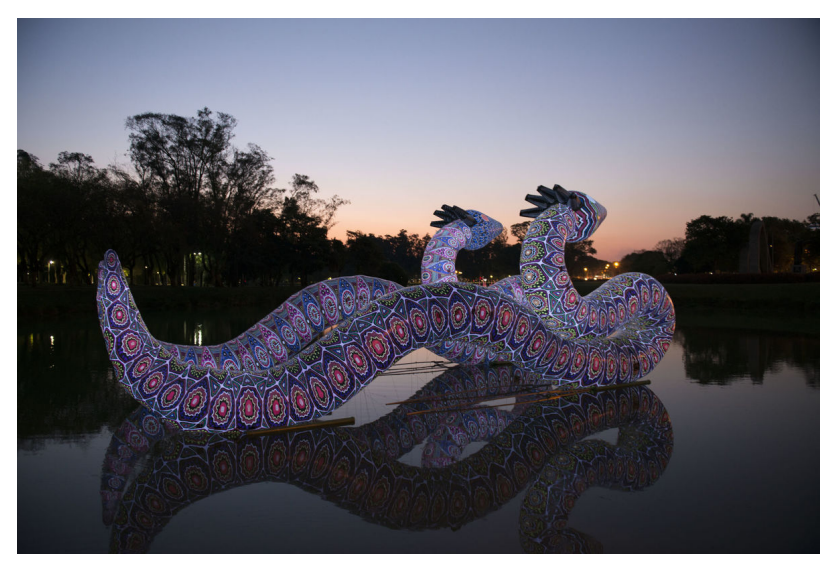
Figure 1.1. Entidades [Entities] (2021) by Jaider Esbell at the 34<sup>th</sup> São Paulo Art Biennial.

Among Esbell's artwork is Entidades (Figure 1.1), an installation of two 17-meterlong and colourful inflatable serpents. In Makuxi cosmology, the snake is a force for healing, regeneration, and transformation (Scarparo, 2021). On the waters of Ibirapuera Park outside the 34th São Paulo Art Biennial, the snakes float in front of the sculpture of Pedro Álvares Cabral, located on the other side of the lake. Cabral was a Portuguese explorer who is generally credited with discovering Brazil in 1500. The snakes also dialogue with the Ciccillo Matarazzo Pavilion, the headquarters of the São Paulo Biennial Foundation designed by Oscar Niemeyer, a Brazilian architect who became known worldwide as one of the key figures in the development of Modernist architecture (Turner, 2022). In addition to Entidades' confrontational meaning - i.e., of challenging western praxis to hail own (or colonizer's) interpretation of history and appreciation of culture and art – Esbell also intended for his work to engage cosmologies and mythological figures outside the narrative of European Christianity, questioning the prominence of western religion in the contemporary world. According to Esbell, Entidades "is a reminder that all original peoples have their gigantic creatures, their importance, their semiotic signs, their entities that protect and care [for them]" (Artforum, 2021).