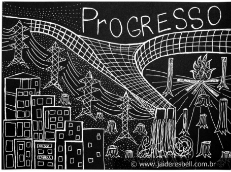
Figure 1.3. Series It was Amazon (2016) by Jaider Esbell.

In black and white colours, the series It was Amazon (Figure 1.3) depicts the ravaging of the Amazon in the form of felled trees, polluted rivers, dead animals (including humans) and armed conflict linked among other things to progress-driven development activities such as illegal land grabs, deforestation, mining, fishing, and animal trafficking, but also legal and concerted megaprojects - illustrated by the expansion of the agroindustry, roads, hydroelectric power dams, and mining. In Esbell's words: