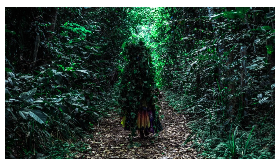
Figure 4.1 Uýra Sodoma, Comer de Si Mesma e Fogo [Eat from Yourself and Fire] (2018) by Emerson Pontes.

The Artivism of Emerson Pontes: Reclaiming Ethnic Identity through Uýra, The Walking