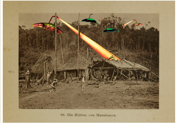
Figure 3.1 Series Ficções Coloniais (ou finja que não estou aqui) [Colonial Fictions (or pretend I am not here)] (2021), by Denilson Baniwa. On the left, King Kong. On the right, Guerra dos Mundos [The War of the Worlds].

Among Baniwa's artworks is Ficções Coloniais (ou finja que não estou aqui) (Figure 3.1), in which Baniwa makes interventions in photographs taken by the German ethnologist Theodor Koch-Grünberg (1872-1924) featuring Indigenous peoples. Baniwa juxtaposes these images with pop culture icons, such as E.T., Alien, Godzilla, and King Kong to transform the colonial fiction of Brazil's "discovery" into an alien invasion. In his words: