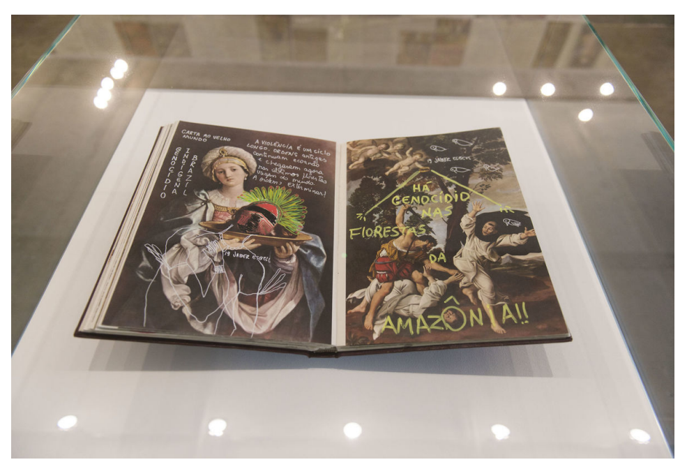
Figure 1.2 Carta ao Velho Mundo [Letter to the Old World] (2019) by Jaider Esbell at the 34th São Paulo Art Biennial.

Carta ao Velho Mundo (Figure 1.2) is another example of Esbell's critique of the power dynamics perpetuated by the colonial legacy of art history. Through his interventions onto the 396 pages of the book Galeria Delta da Pintura Universal (Valsecchi, 1972), an illustrated encyclopaedia of the western art history, Esbell shed light on the ongoing struggles faced by Indigenous communities. The showcased pages in Figure 1.2, exhibited at the 34th São Paulo Art Biennial, display Esbell's interventions on 17th century Italian Baroque paintings using acrylic markers. On Guido Reni's "Salome with the Head of Saint John the Baptist", Esbell drew a headdress and tribal markings. Adjacent to Salome's head, the text reads: "Violence is a long cycle. Old orders continue to echo and have now reached the world's last virgin forests. The order? Exterminate!". On Domenichino's "The Martyrdom of Saint Peter", Esbell intervened with small birds into the trees and the text: "There is genocide in the Amazon forests."