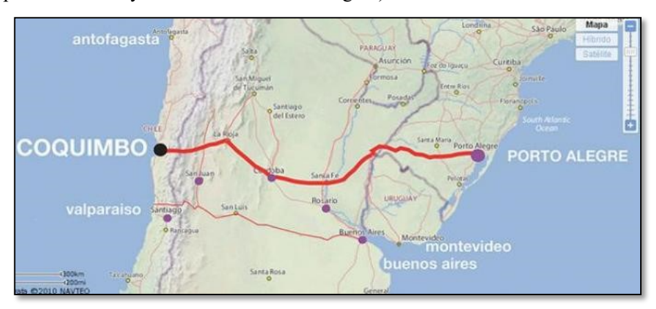
Image 3: Central Bi-Oceanic Corridor.

the irruption of China in South America, becoming one of the main trading partners of many of the countries in the region).