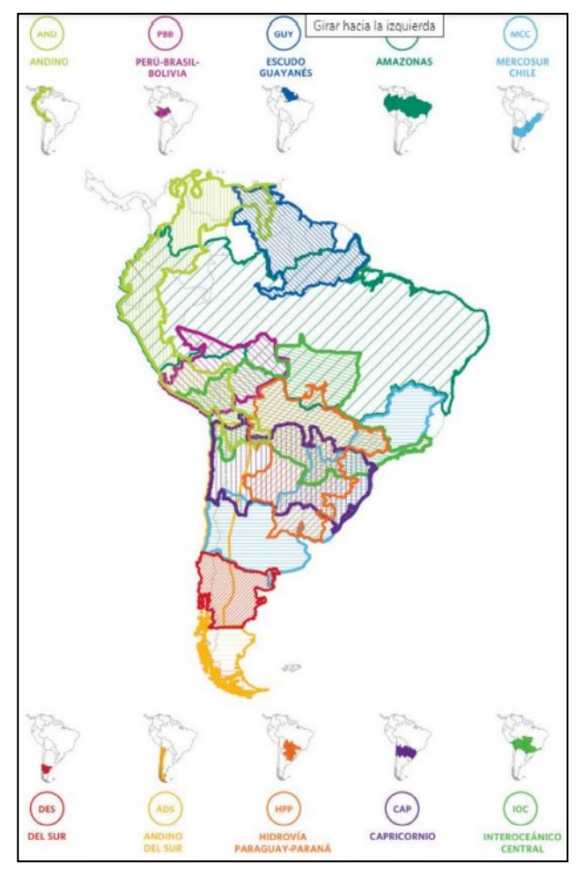
Image 1: IIRSA Axes of Integration and Development.

In this way, 12 development axes were outlined throughout the subcontinent (as can be seen in the image below). Within each one of them, the main projects to be promoted were proposed that would favour the circulation and interconnection of commercial centres with the exit points to international markets. On the other hand, the construction of energy infrastructure works was proposed that would have the capacity to supply the main centres, interconnecting regions energetically, which would allow the economic growth of some countries, especially Brazil, to be sustained.