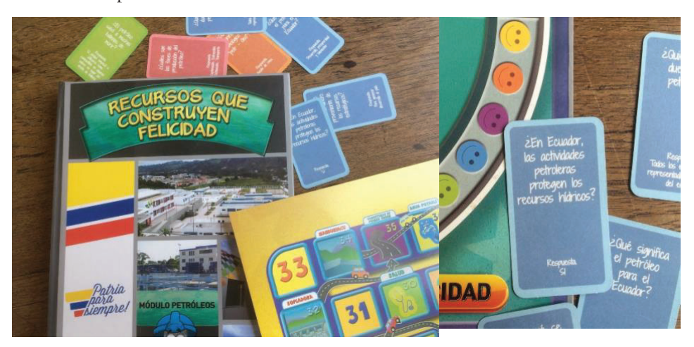
Image 5: The game "Resources that Construct Happiness"

water resources in Ecuador?" Correct response: "Yes". Unfortunately, the cards gave no further explanation.