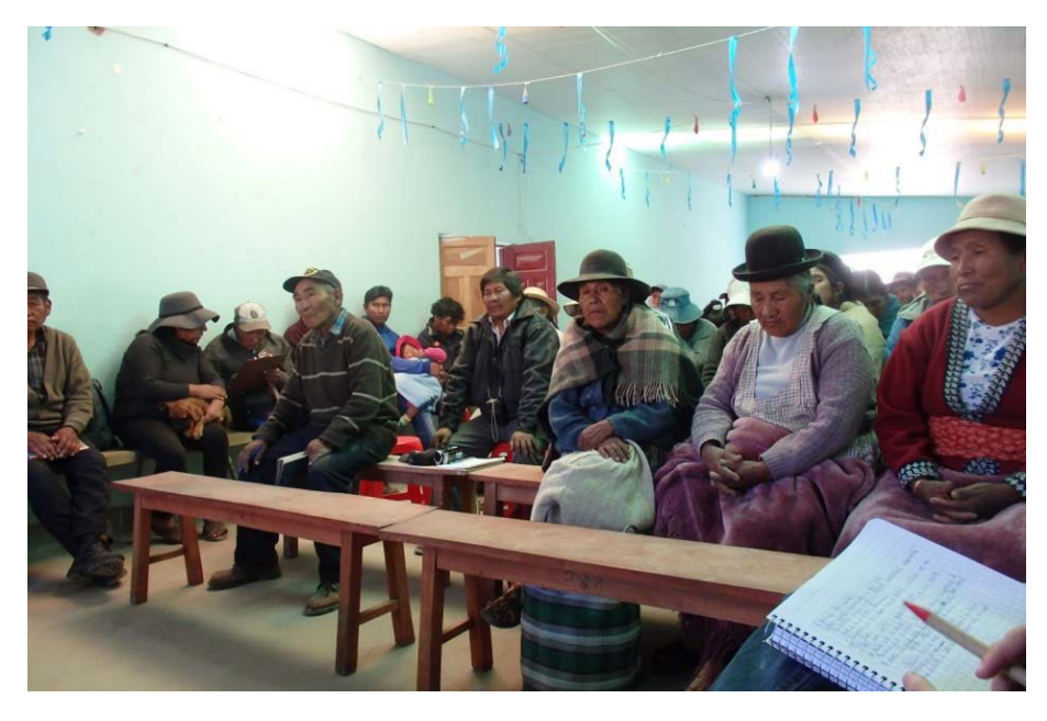
Meeting of the cooperative SOPROQUI, community of Aguaquiza, Nor Lipez