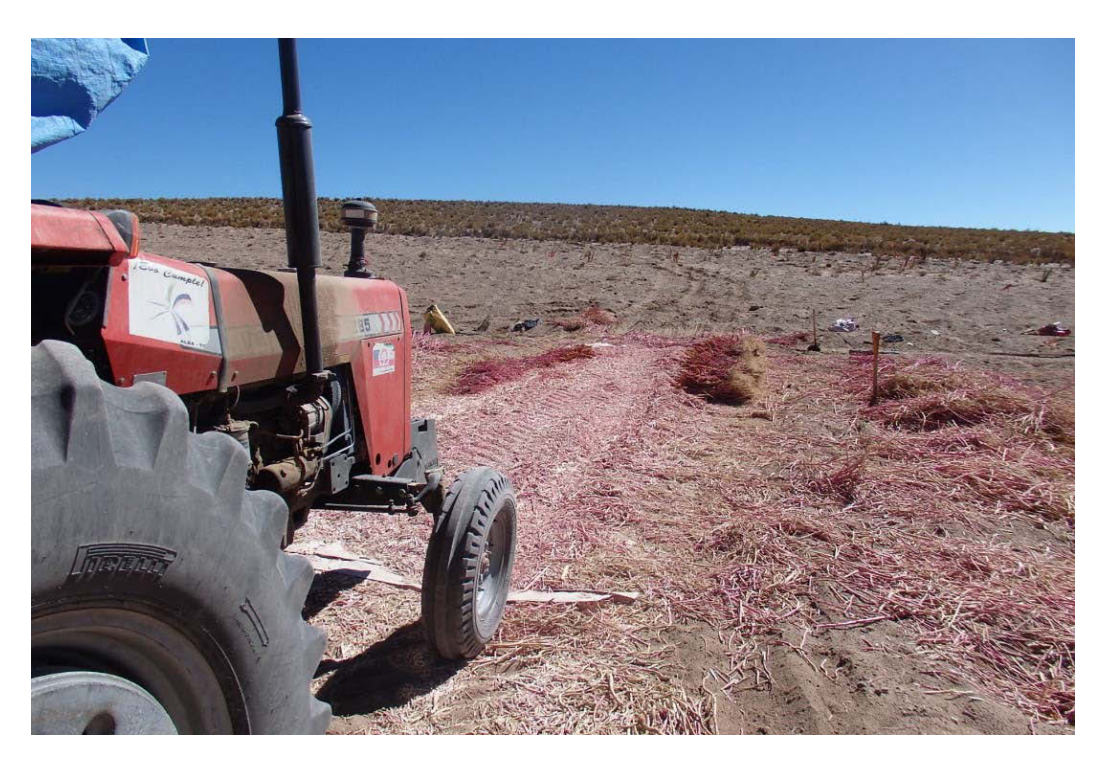
Tractor used for threshing quinoa grains, community of Copacabana, Nor Lipez

A significant share of the ploughing and sowing activities are now undertaken with tractors. The few producers who own these assets can extract important benefits by renting them to other quinoa farmers. This process may also contribute to increasing wealth concentration in the hands of a few particularly successful producers. Where exchanges of labour in times of harvest or sowing were previously practised as reciprocal exchanges and manifestations of solidarity (Vieira Pak 2012), they are now increasingly commoditized.